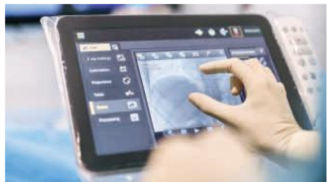
Collimate and pan with a fingertip on the touch screen module Pro

The Switchable Monitors option can accept 16 video sources in total and display sources to the widescreen monitor display. Simply drag and drop the input icon on the touch screen modules to switch inputs.