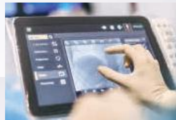
Touch screen module Pro

customizable and user-centric workspot in the control room